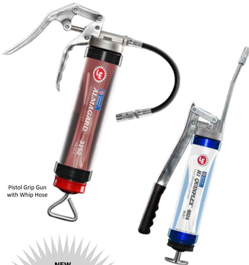
Pistol Grip Gun with Whip Hose

Reliability tool helps eliminate maintenance errors.