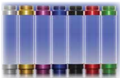
Clear Grease Tubes with Color Options